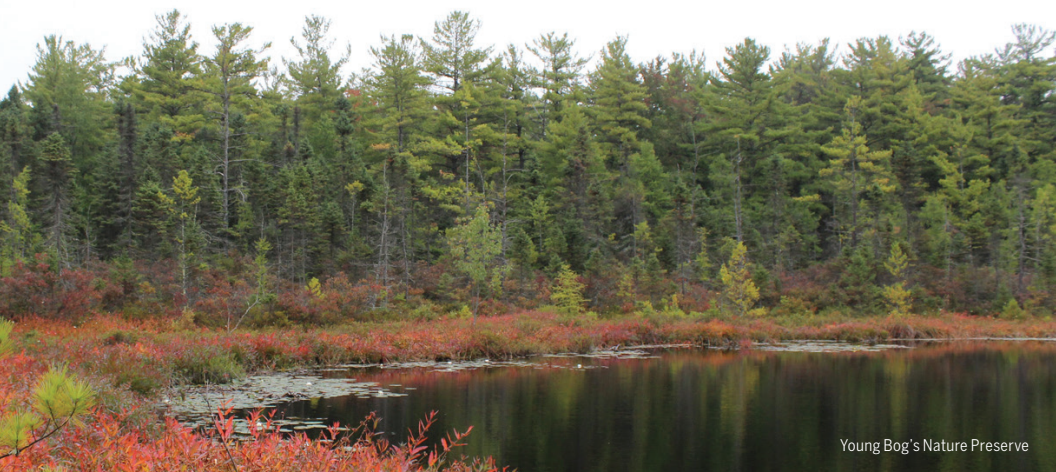
Young Bog's Nature Preserve