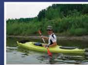
▶▶ Hoosic River paddle under the Buskirk covered bridge.