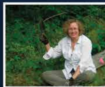
▼ Historic cemetery restoration and clean up.