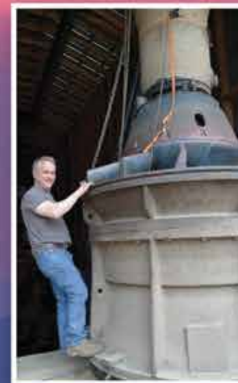
▶ RLT Acquisitions Team